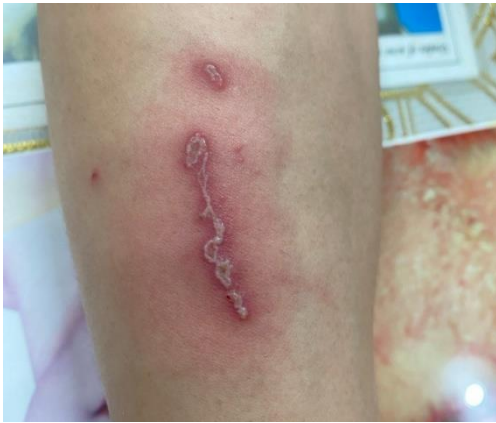
Figure 2. Case 1- ICD in a linear pattern caused by Paederus beetles on the right forearm.