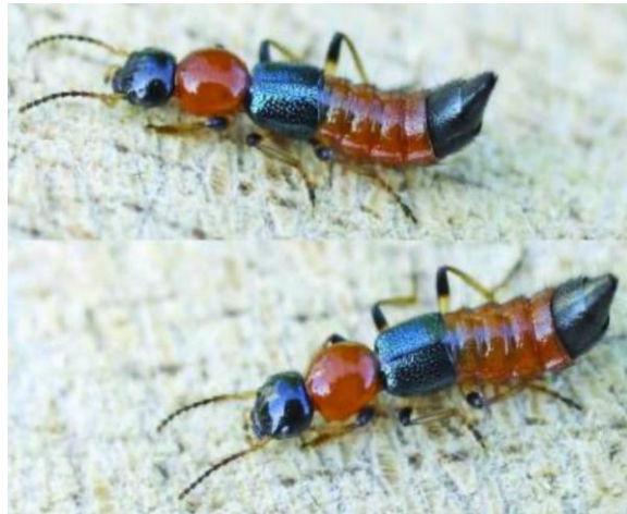
Figure 1. Adult Paederus beetles with length and width between 7-10 mm long and 0.5-1 mm wide. They have a black head, a thorax, an upper abdomen, a lower abdomen, and an elytrum (Structuring covering the wings) [8]

Paederus dermatitis (PD) is a specific type of irritant contact dermatitis (ICD) triggered by a beetle from the genus Paederus , which is a part of Staphylinidae family [1]. The hemolymph of some rove beetles in the Paederus genus contains the vesicant pederin, which is thought to be produced by endosymbiotic bacteria [2]. There are around 1.5 million species living on earth, yet the beetles are accountable for 25% of all described species [3]. PD also referred to as dermatitis linearis, is a condition caused by the toxin released from the above-mentioned arthropod [4]. Rarely does this insect bite or sting, yet the fluid released from this beetle usually contains pederine, a potent vesicant agent [1]. The toxin inside these insects' body fluids can lead from erythematous to vesicular/bullae lesions, and a burning/pain sensation on the exposed areas of the body [4]. According to Kumaraguru et al., these insects are usually 7-10 mm long and are distinguished by vivid orange or red stripes on the pronotum and the base of the abdominal segments (Figure 1). People tend to confuse the Paederus beetles with ants. These insects are capable of flying, but they still prefer to crawl and exhibit phototaxis to fluorescent light, specifically a long wavelength white light. Additionally, Kumaraguru and his colleagues observed that the beetles tend to curl up their abdomen when running or being disturbed, which may indicate why they are easily crushed due to their vulnerability [4].